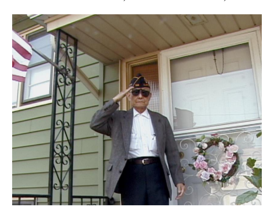
Photo caption: A still from "Every Day is a Holiday,"

The Thomas Edison Film Festival (TEFF) presents an in-person film screening in honor of Veterans' Day, Monday November 7, 2022 at 1:00PM, at the Fair Lawn Senior Center, 11-05 Gardiner Rd., Fair Lawn, NJ.